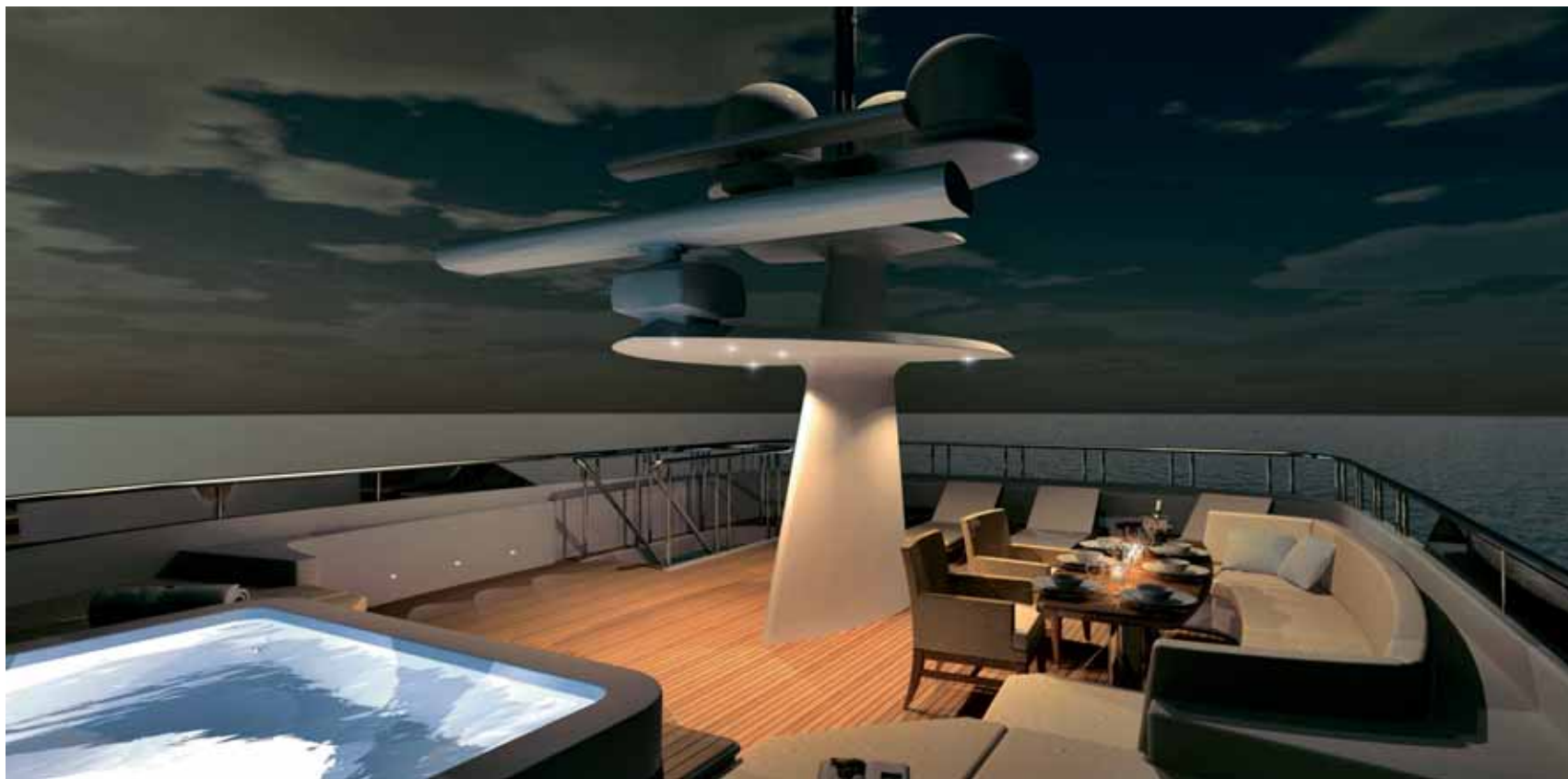
On these pages, the night time renders show the external decks: above, the spacious sundeck with a 360° panoramic view; below, the relaxation area on the bridge deck in front of the wheelhouse.

Ocean Alexander's range currently consists of various series of semi custom yachts: the Trawler Yacht Series, comprising two models measuring under 100 feet; the Pilothouse Yacht Series, comprising two models measuring under 100 feet; and the Motor Yacht Series, comprising five models measuring under 100 feet and two models measuring over 100 feet, namely the 102' Motor Yacht and the 102' Cockpit Motor Yacht. These have now been joined by the new Mega Yacht Series, which consists of three models all measuring over a hundred feet; the 36.5 metre 120' Mega Yacht; the 41 metre 135' Mega Yacht; the 47 metre 155' Mega Yacht.